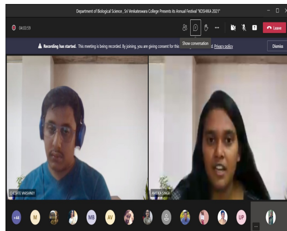
SNAPSHOTS OF THE CONDUCTION OF QUIZ